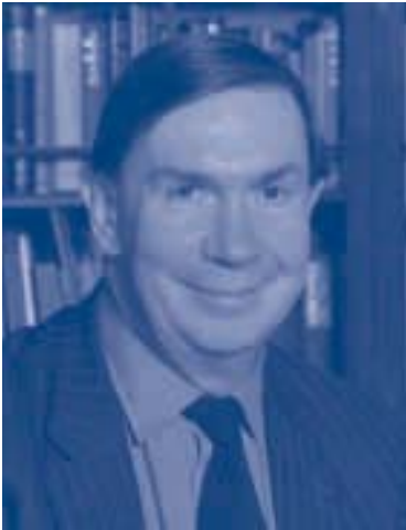
The Rt. Hon. The Lord Irvine of Lairg, Lord Chancellor

The Human Rights Act has already received publicity through various cases, reported in the media, but there is a continuing public demand to know more about the Act and how it works, what it is for and what it means for people. We hope that this Guide will help meet that need.